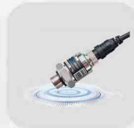
SP100 pressure sensor