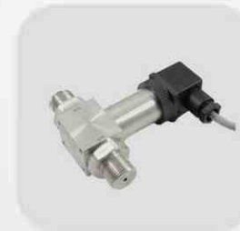
SPD differential pressure sensor