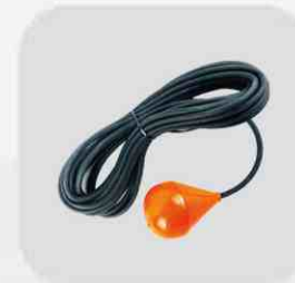
Heavy Duty Float Switch

Power: 0.25-4 kw Head: Up to 78m Flow: Up to 30m 3 /h