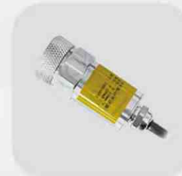
SV 100 integrated vibration sensor