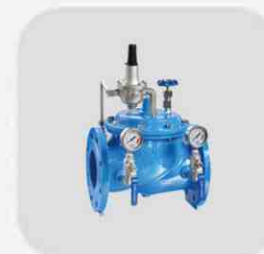
200HCV control valve