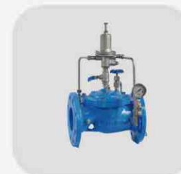
500HCV control valve