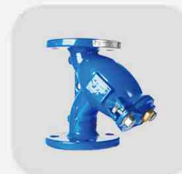
Ball check valves