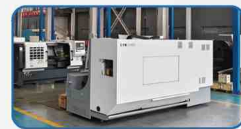
Moscow office building constant water supply project