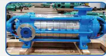
Indonesian shopping mall pressure water project