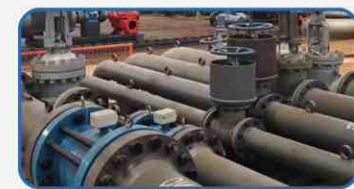
South Africa Constant pressure water supply Project