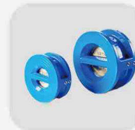
Double check valve