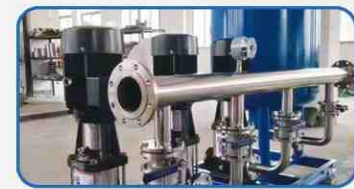
Vietnam office building water supply project