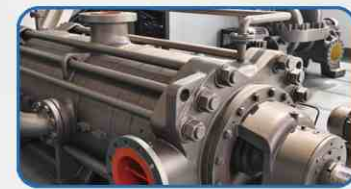
Thailand power plant circulating pump project