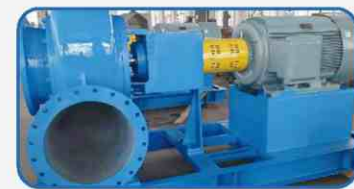
USA slurry pump project