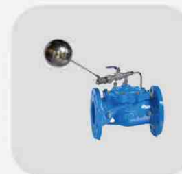
100HCV control valve